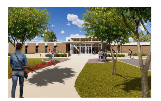
Conceptual rendering of Starr Hall.

County and the region, University of South Carolina Lancaster (USCL) leaders embarked on a master plan update, building from the 2008 master plan. Since 2008, USCL constructed an iconic gateway sign on Highway 9, installed fencing, built Founders Hall, became a Palmetto Regional Campus with added academic programming, opened a location in Indian Land (the northern panhandle of Lancaster County), and elevated the collaborative four-year BSN program into one of the top nursing programs in the Carolinas. The university has a renewed vision for greater impact in the future. The vision for the next decade bloomed from numerous stakeholder meetings. particularly in discussions with Indian Land business leaders. The vision speaks to the possibilities, dreams and capacities of the university. Visit our website to read the full master plan.