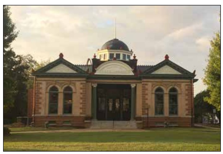
Erected in 1905, the Union Carnegie Library is housed in the oldest library building in South Carolina and it was built with a $10,000 grant from the Carnegie Corporation. In 2009, the Union library was named the Best Small Library in America by the Library Journal.

other, it made sense to move the USC Union library system to Carnegie. The partnership benefits faculty, staff, students, and the community as a whole. Carnegie offers more resources, technology, computer usage, and much more. Their extended evening and Saturday hours will greatly benefit the students, especially during exam times.