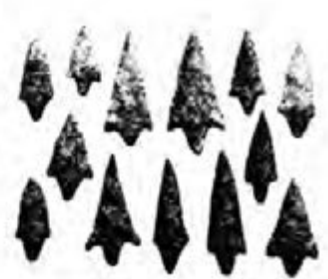
Morrow Mountain Points

listed as middle Archaic points. The time period is 8000 to 6500